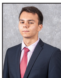
4 Andrei Arion So. - G - 6-3 - 180 Bucharest, Romania