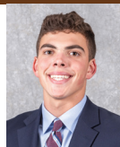
2 BETLOW So. | G | 6-2

PPG 7.0 RPG 4.5 FG% 54.5% 3FG% 33.3% APG 2.5